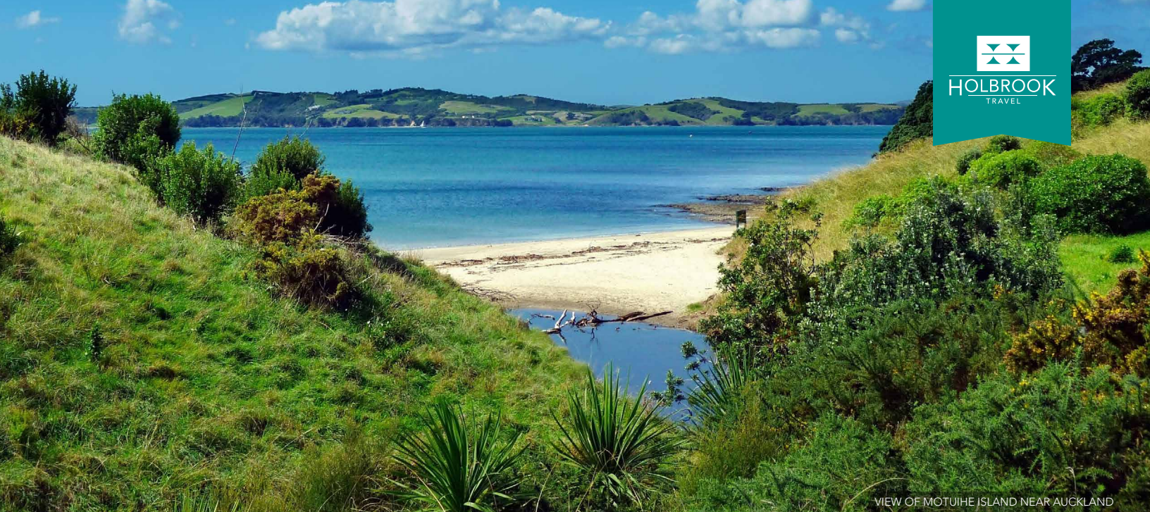
VIEW OF MOTUIHE ISLAND NEAR AUCKLAND