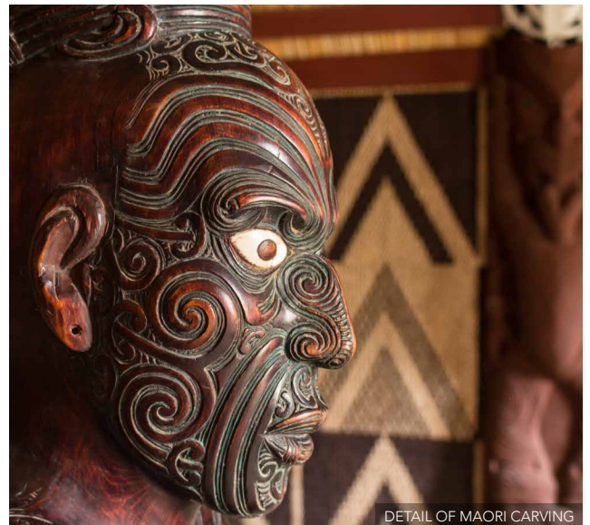
DETAIL OF MAORI CARVING

This morning, receive an introduction to waka, Māori watercraft that include war canoes and double-hulled voyaging canoes. Hear about the current revitalization of these waka and how they are used today. Learn paddling skills and the rhythmic chants used to