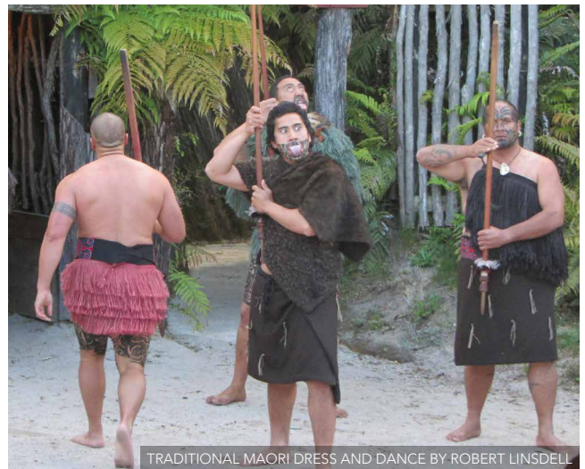
TRADITIONAL MAORI DRESS AND DANCE